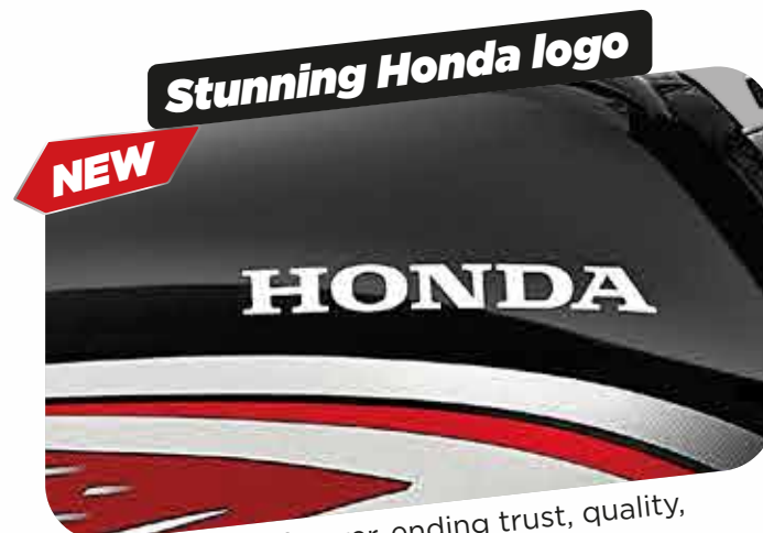
NEW Stunning Honda logo

All new enriched and splendid graphic design that compliments the overall look of the bike.